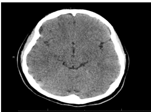
Figure 3: Normal brain computed tomography scan.

amphetamines, methadone, and barbiturates were all negative. Brain computed tomography [Figure 3] and chest radiography were also unremarkable. All her laboratory investigations were normal apart from low bicarbonate (17 mmol/L) and elevated lactate (3.5 mmol/L).